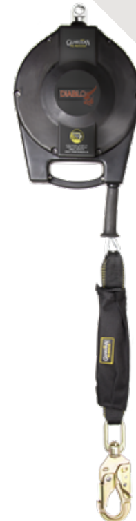
Diablo Big Block SRL